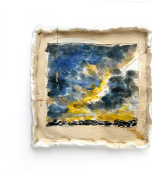
LIBBY SIPE Cougar, 2024 Paint skin, chemically oxidized copper leaf, phthalo blue (green shade), sahara yellow, vinyl emulsion attached to cradled panel 10 x 10 in (h x w)