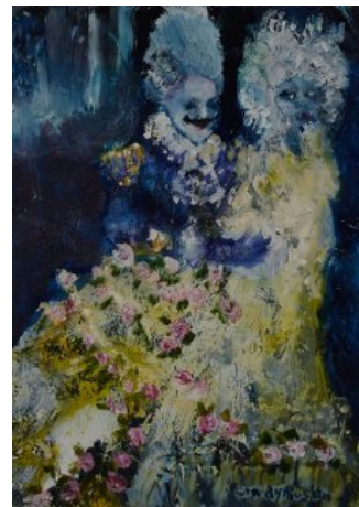
CINDY RUSKIN To Be a Flower, Is Profound Responsibility, 2019 Oil on wood 7 x 5 in (h x w)