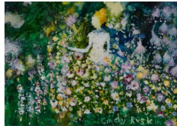
CINDY RUSKIN She Sweeps with Many-Coloured Brooms, 2022 Oil on wood 9 x 12 in (h x w) $ 725