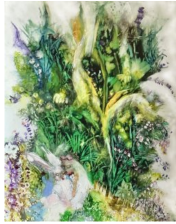
CINDY RUSKIN I Haven't Told My Garden Yet, 2019 Oil on wood 5 x 7 in (h x w)