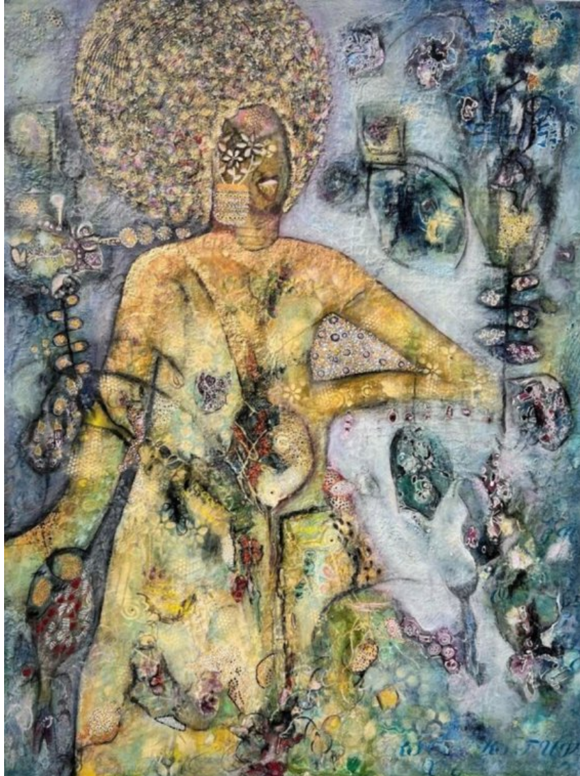
ADEOLA DAVIES-AIYELOJA Golden Elegance I, 2023