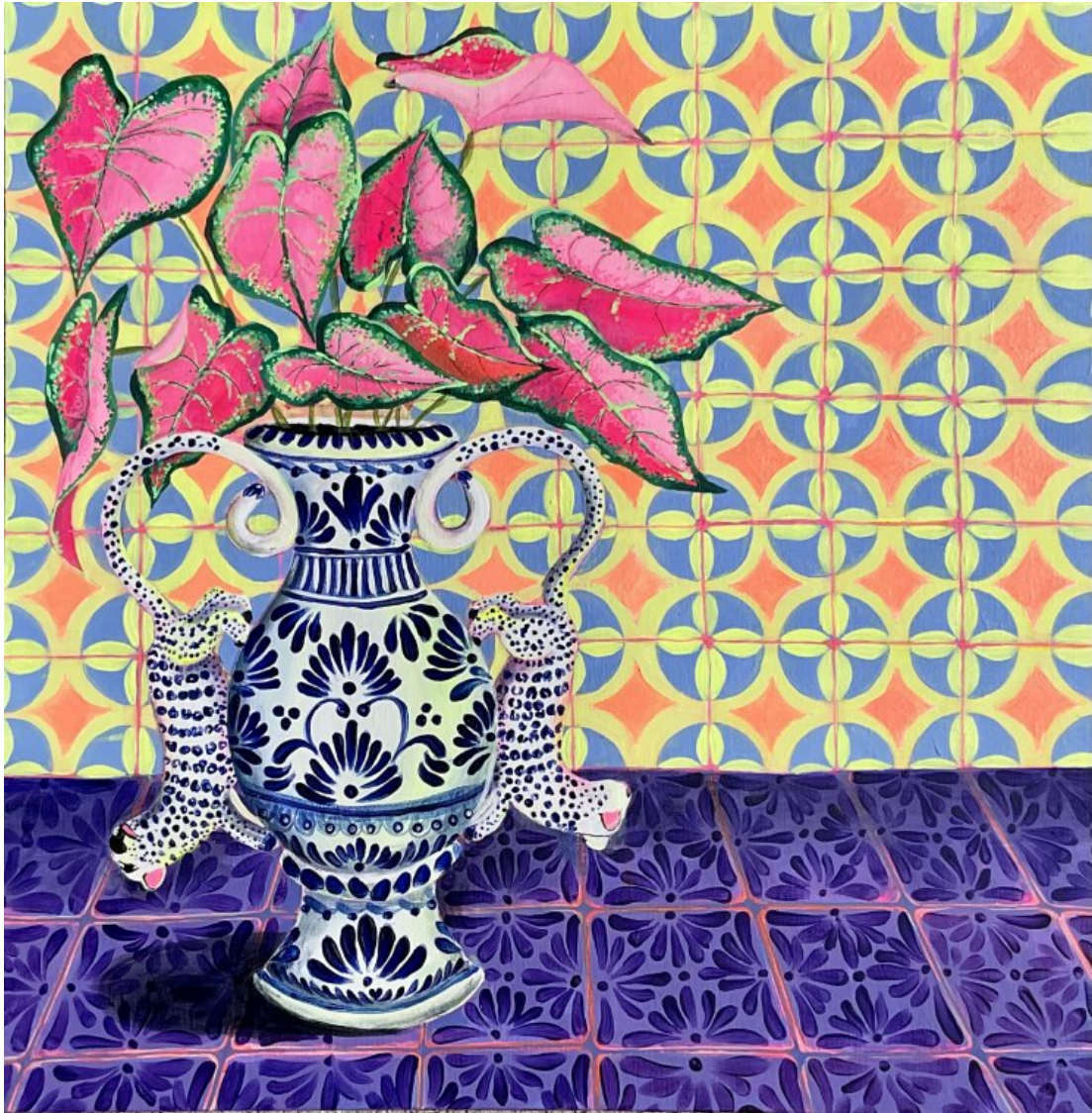
CECI LOEL Tigres, 2024 Acrylic on canvas 50 x 50 cm (h x w)