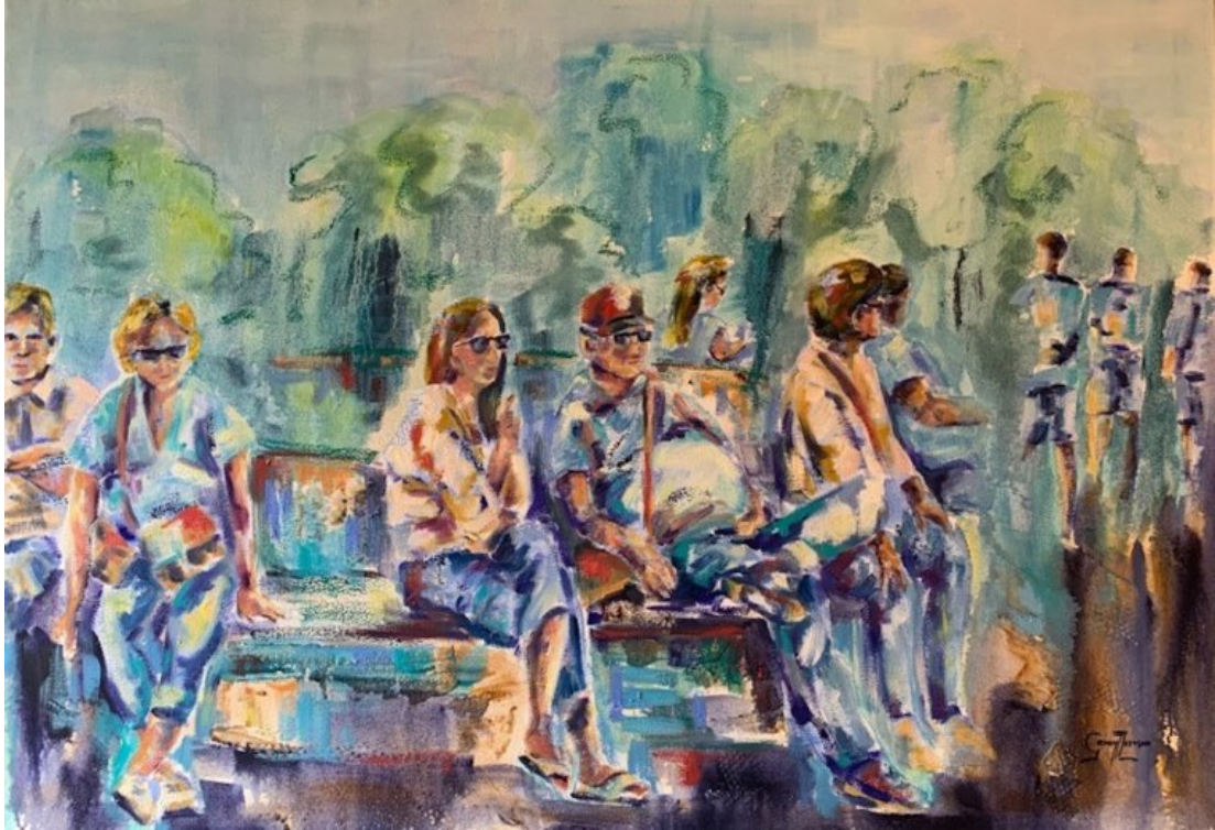
GRADY T ZEEMAN Observing, 2024 Oil on canvas 70 x 100 cm (h x w)