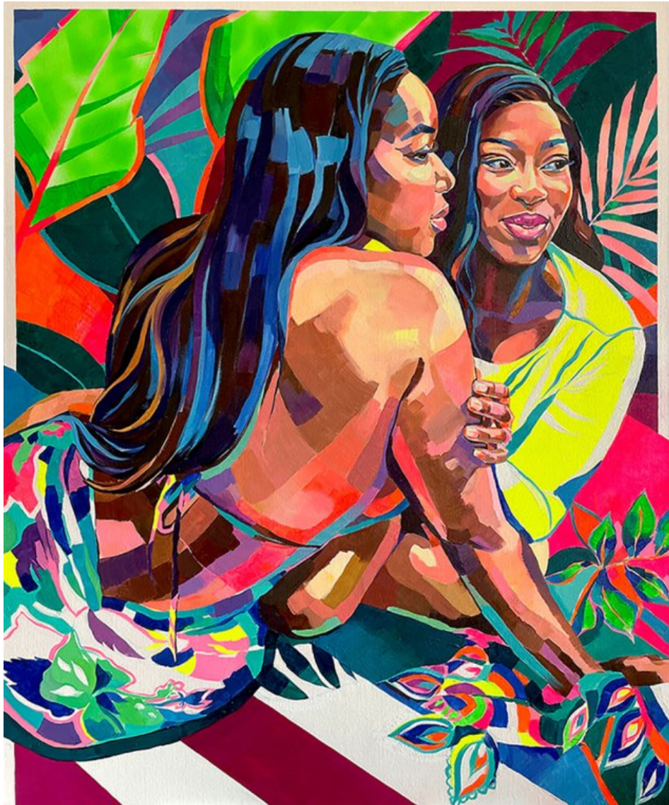
JOANNA PILARCZYK Sisters, 2024

Oil and acrylic on canvas 120 x 100 cm (h x w)