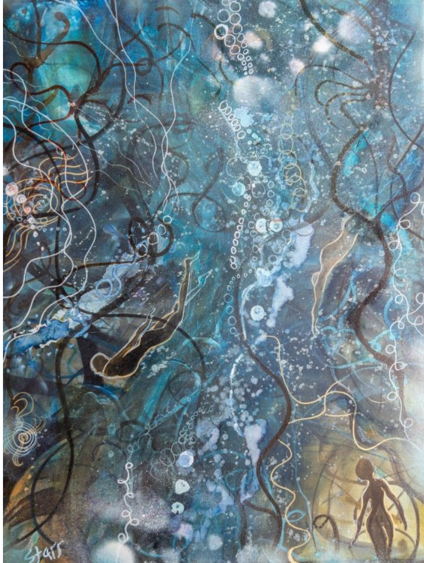
ERIN STARR Ocean Harmony, 2024 Oil, acrylic, ink on linen 24 x 18 in (h x w)