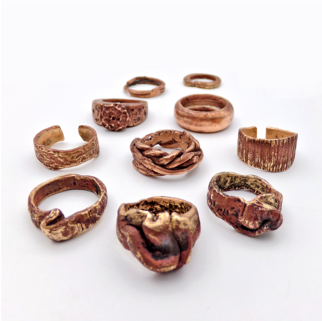
ALEKSANDRA DEDIC Emperor's New Clothes, 2024 Rings, bronze 80 x 80 cm (h x w)