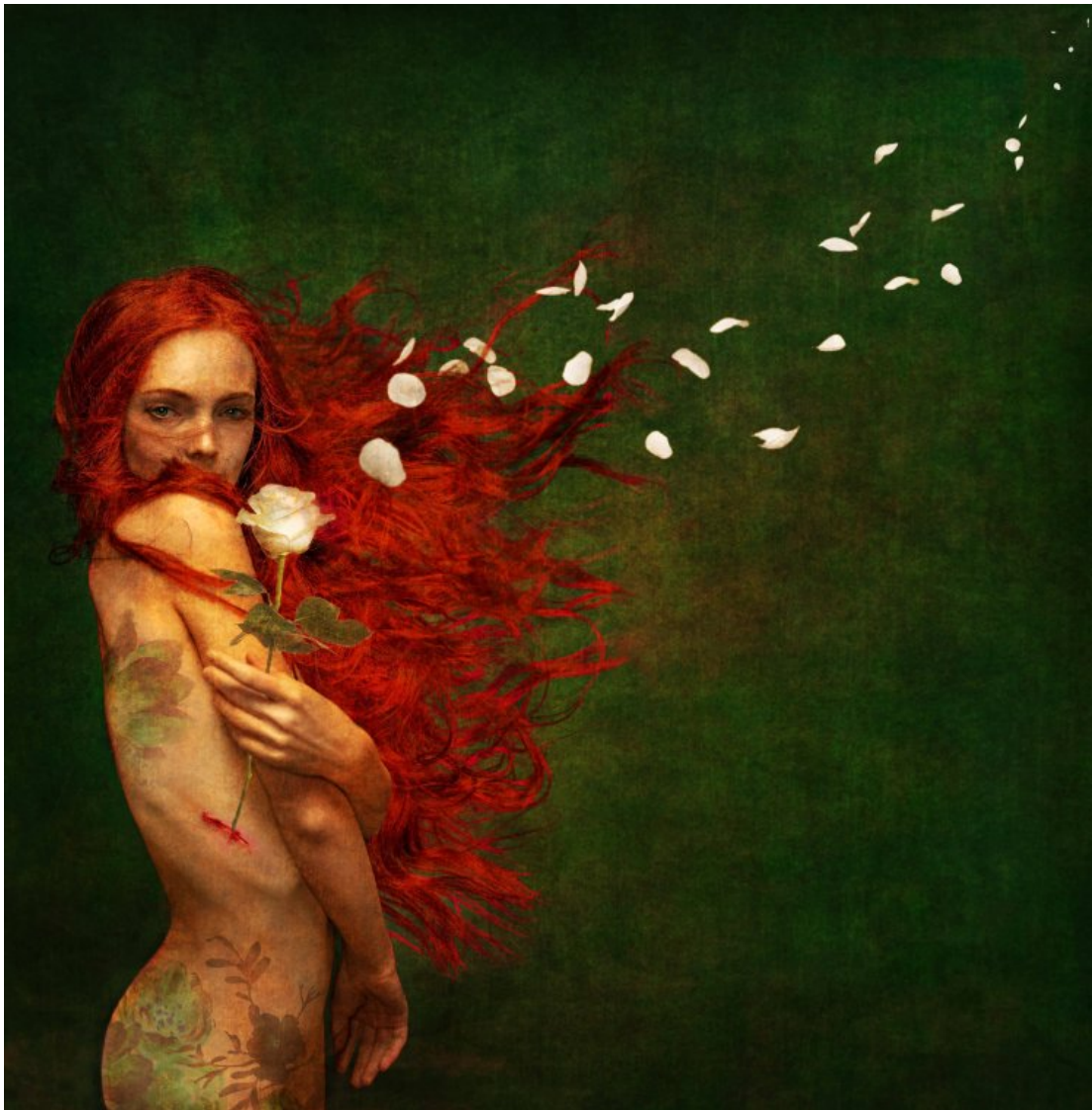
VANESSA WENWIESER There Is Always A Light, 2023 Digital art 76 x 75 cm (h x w)