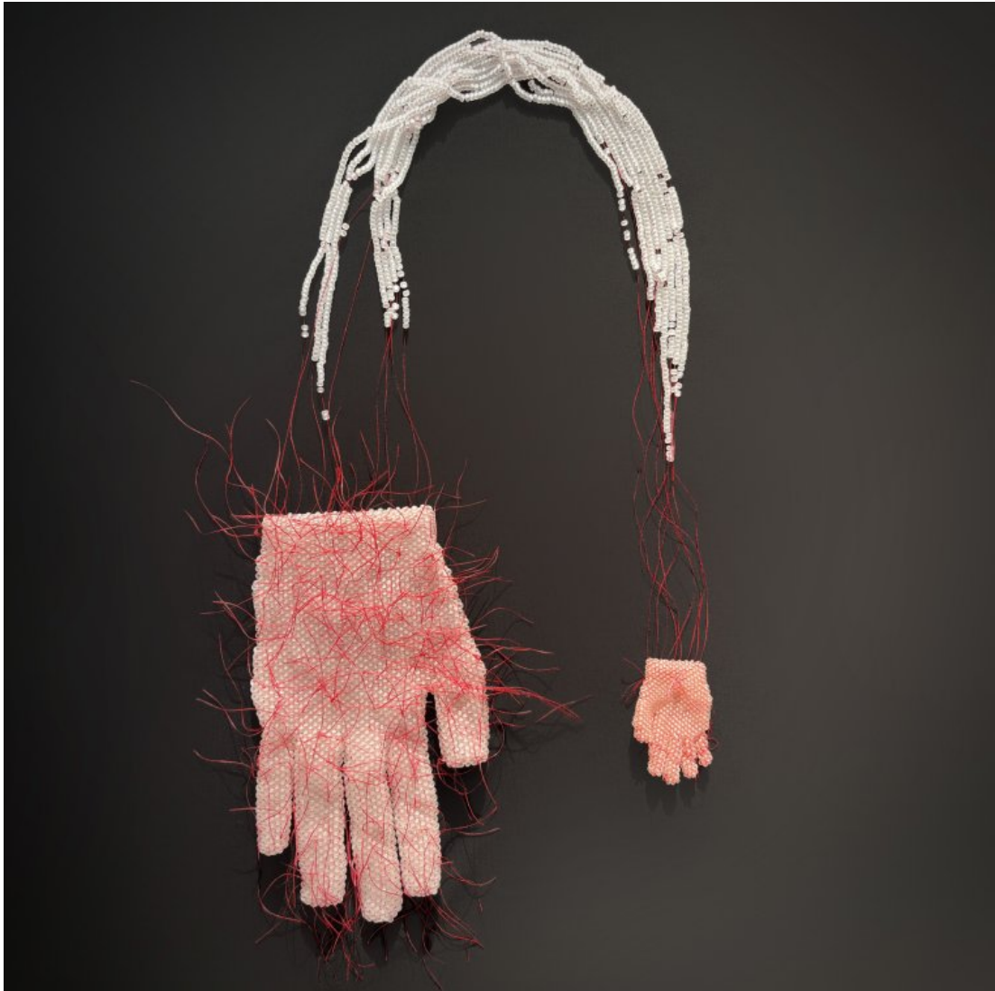
MENGJIE MO Swell, 2023 Glass beads 12 x 11 in (h x w)