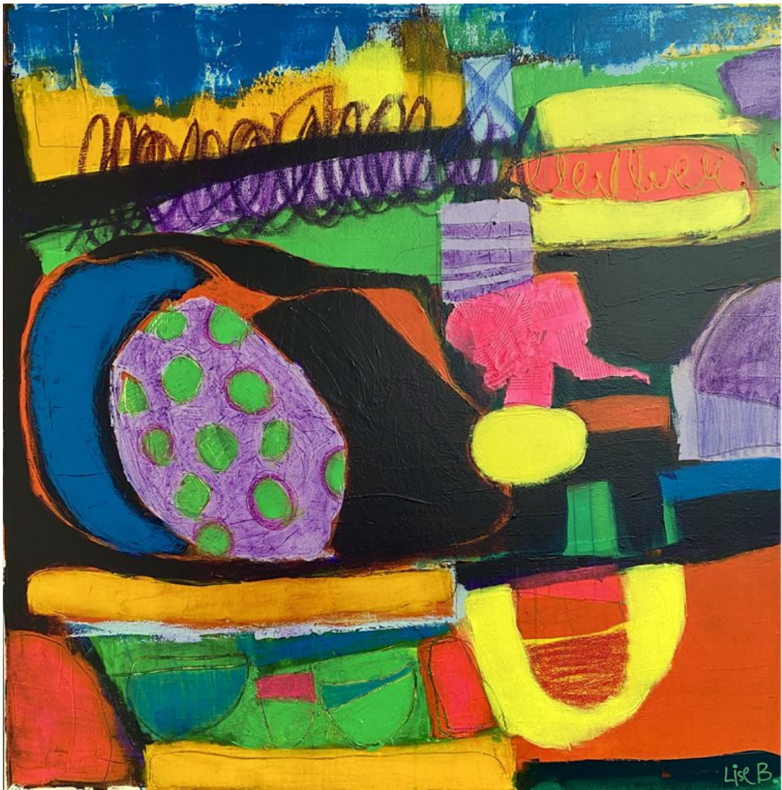
LISE BJERKAN The Elephant In The Room, 2024 Acrylic and mixed media on canvas 100 x 100 cm (h x w)