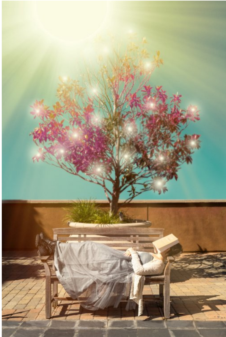
CEILI SEIPKE The Differential Diagnosis Of Dreams, 2024 Photo on Fine Art Paper 18 x 12 in (h x w)