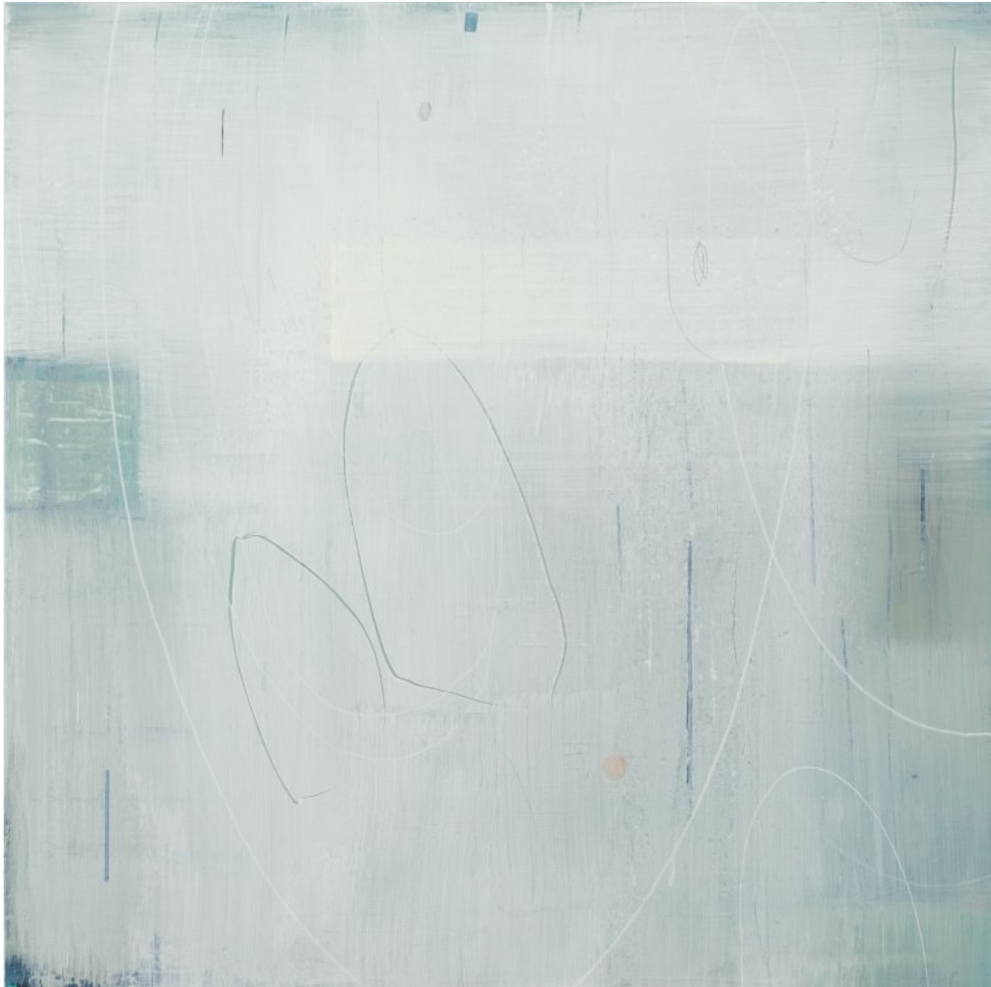
JANET TAYLOR Lace Morning, 2024

Acrylic and mixed media on cradled panel 24 x 24 in (h x w)