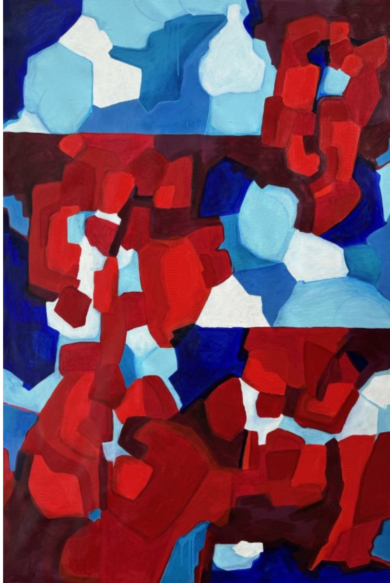
SAMANTHA MALONE Moving Landscapes, 2024 Acrylic, oil pastel and watercolor pencil on canvas 140 x 94 cm (h x w)