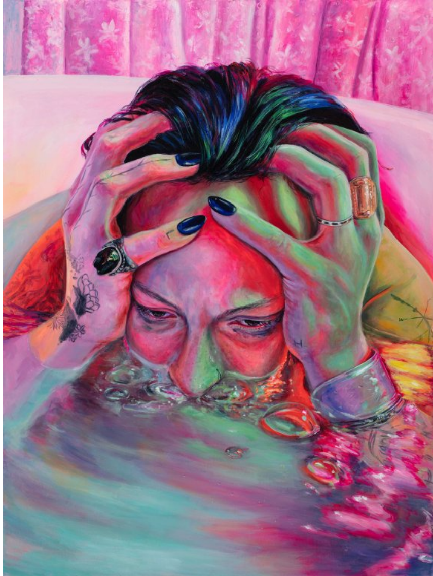
LILLIAN AGUINAGA Ferment, 2024 Acrylic on canvas 40 x 30 in (h x w)