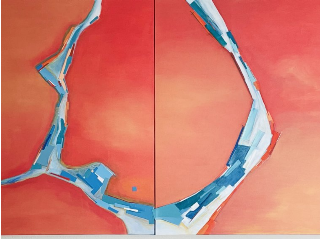
TIFFANY HENG-HUI LEE Entrenched Meander-Horseshoe Bend, 2024 Paint, ink, paper, colored pencil 30 x 48 in (h x w)